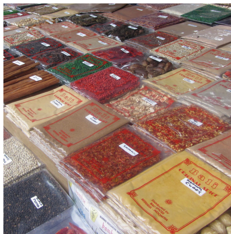
FIGURE 2: Culinary herbs at the spice market in Bali, Indonesia.

Julia Child said, “Learn how to cook - try new recipes, learn from your mistakes, be fearless and above all have fun.” When I started adding certified organic (or at the very least pesticide-free) essential oils to my cooking, the “learn from my mistakes” and “fearless fun” began! Perhaps you’re ready to use essential oils in your recipes but are feeling too anxious to try them out. Just in case, I’ve put together this Top 10 Culinary Essential Oils eBook with a few tips to get you started!