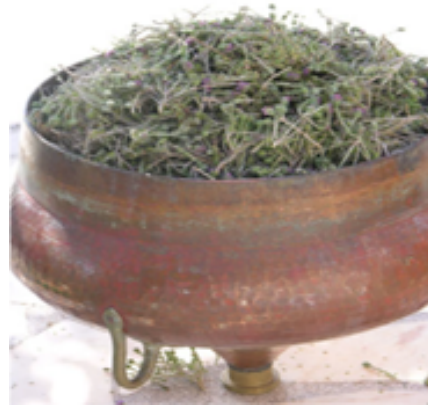
FIGURE 12: Thyme still in Greece.