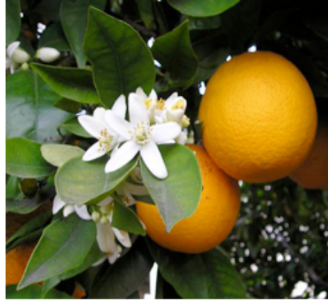
FIGURE 9: Neroli flowers, Italy.