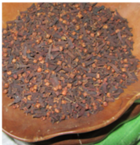
FIGURE 7: Cloves dried in a bowl.