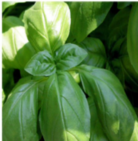
FIGURE 4: Basil. Image by Dorene Petersen. © 2009