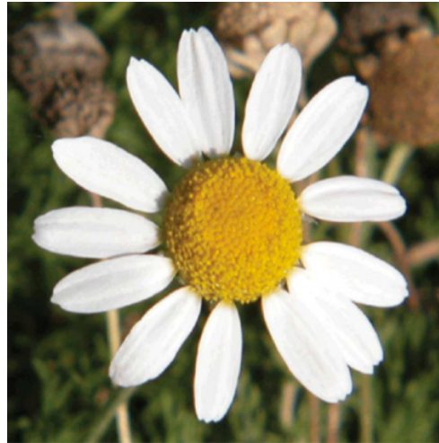
FIGURE 6: Chamomile Roman .