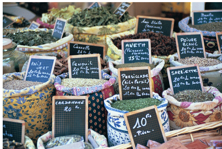
FIGURE 1: Culinary herbs at the spice market in France.